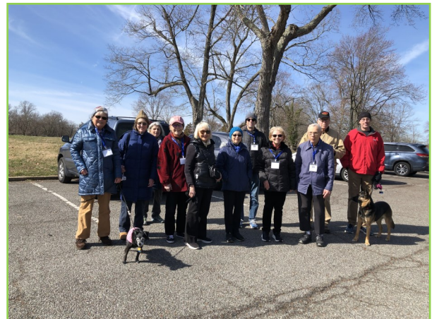
A great turnout for the Walking Group on a gorgeous day in March